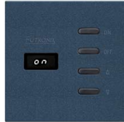
SP4 Diamond Blue